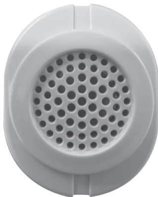
Product Code STV826/STV828